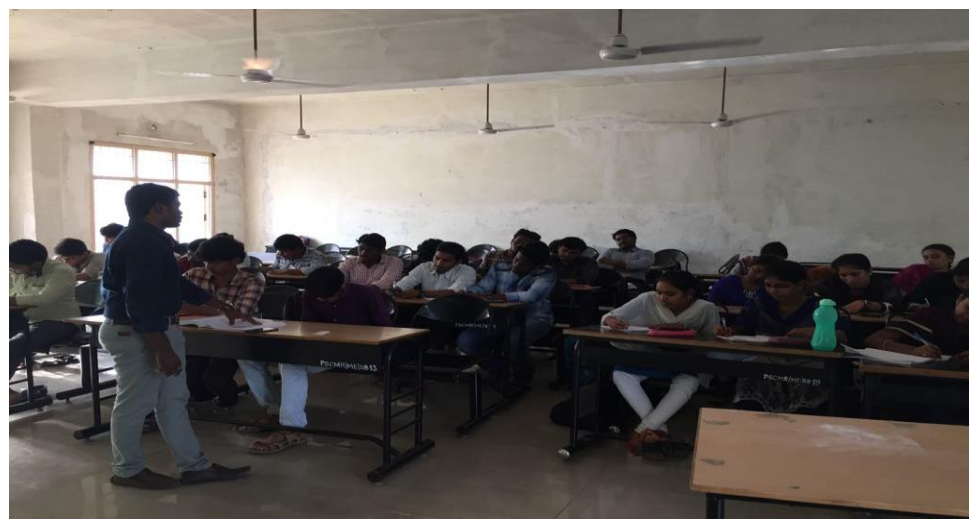
Gate classes for Mechanical Engineering Students

Following students benefited from guidance provided for GATE/GRE etc