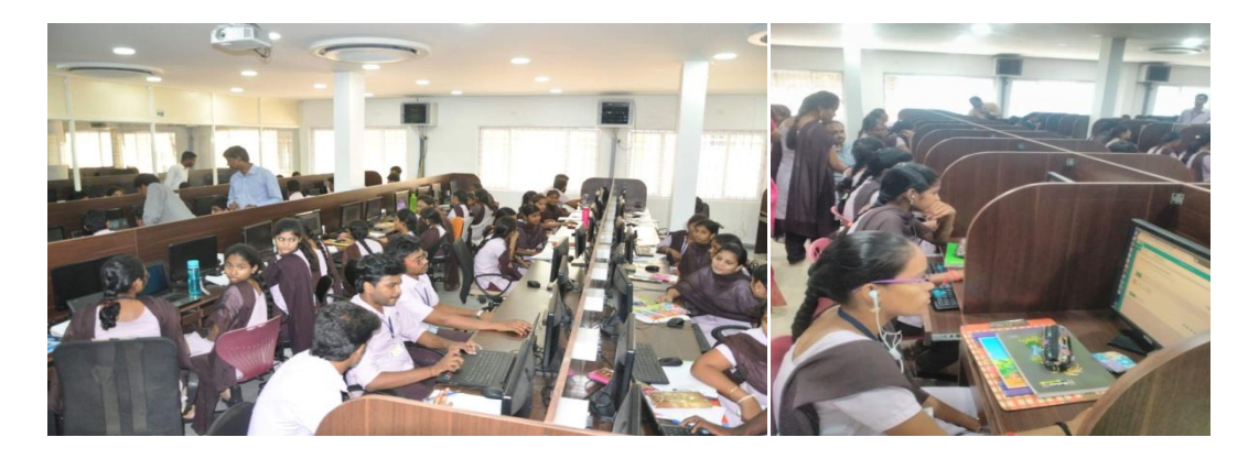
Students using the resources available in State of Art Language Lab

In this present day scenario, a technical student without English competence is like a fish out of water, losing his/her significance. The student of Engineering and Technology needs a specific set of language skills for success in education and career. With a view to developing students' competence in LSRW Skills in English, the English Proficiency lab was set up. This lab was designed to provide the students with a strong platform for practical training in the language. Here students are exposed to functional language in use and are familiarized with the many pronunciation styles that are vital in everyday usage of the English language in today's world. In the Lab the students are trained by efficient teachers with the help of soft wares like Rosetta stone, Learn to Speak English, Pronunciation Power etc., along with the CDs prescribed by JNTU Kakinada. The lab is provided with 65 computers, a projector, audio system and 24x7 internet facility to facilitate the enhancement of communicative abilities. The JNTUK English Curriculum develops the students' ability to communicate and also fosters a high liberal arts background. Such a background gives students not only marketable communication skills but also an understanding of the history and development of civilization.