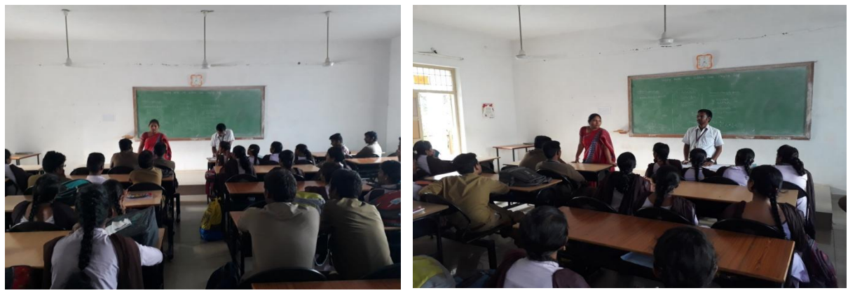
Counsellors interacting and motivating students

We have strong student personal counselling system, where each student will be associated with one of the faculty member from joining the college till the completion of course for continuous mentoring and look after the concerns of students and provide them moral support for overall development of the student. For each class there will be 3 counsellors , students divided among 3 counsellors . under each counsellor good, average & week students were monitored regularly. Good students who don't have backlogs and good in academics were encouraged to develop models related subjects or recent trends. Average and weaker students were motivated to complete their backlog subjects. Counsellors use to build the confidence in each student, so that at the end of his graduation student will be able to incube in the job market available outside. Students use to convey their difficulties to Counsellors, so that counsellors come across solutions to the problems or difficulties raised by students. Regularly Personality with the help of eminent personalities like Mr.Yandamuri Development programs Veerendranath, Mr. Pattabhiram, Mr. G. Narasimha Rao, Prof. Murali Krishna etc held for inculcating positive self esteem and self belief in students. Parents meet regularly held per each semester to take the valuable suggestions from parents for continuous development of the Institution.