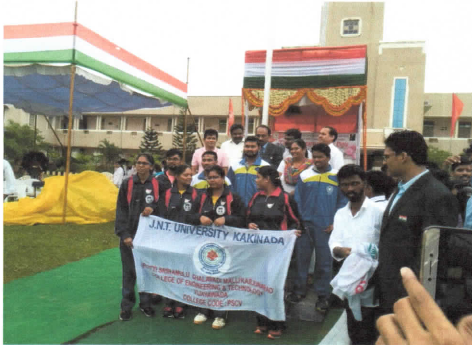
Photo: NSS Volunteers participated in march-fast at JNTUK Kakinada

On 15-08-2018 NSS Volunteers of PSCMR CET were participated Independence day Celebrations at JNTU Kakinada.