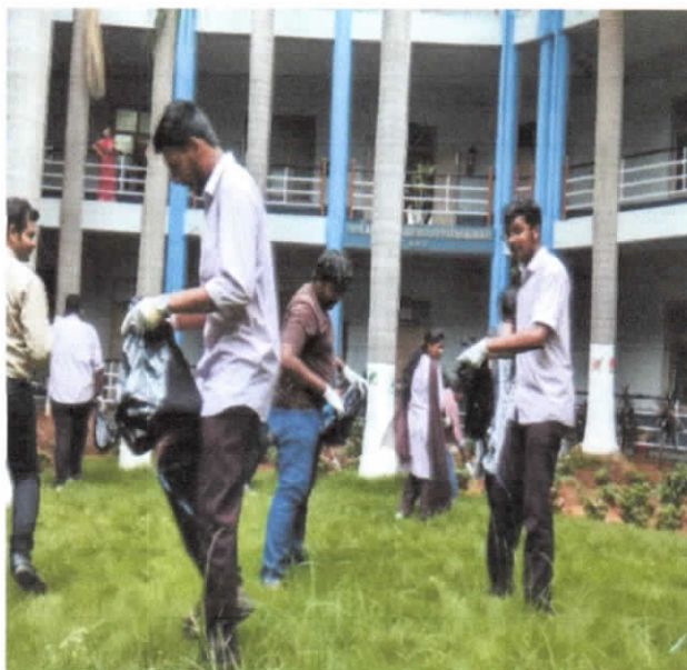
Photo: NSS Volunteers participated in the event.

NSS volunteers of PSCMRCET participated in Swachh Bharath programme on 15-07-2018. The purpose of this programme is to bring about an improvement in the general quality of life in the rural areas, by promoting cleanliness, hygiene and eliminating open defecation. To accelerate sanitation coverage in rural areas to achieve the vision of Swachh Bharat.