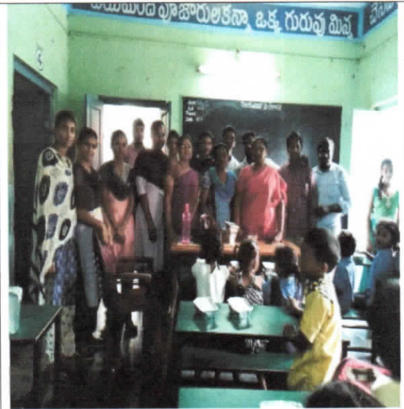
Fig:In the above figure the Faculty and students of various Departments of PSCMR CET has distributed Breads to school children