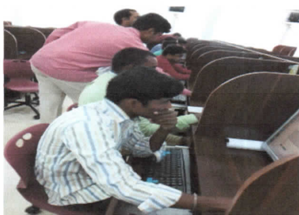
Photo: NSS Volunteers supporting the voter enrolment programme.