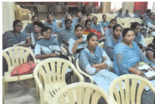
Students participated in this awareness program