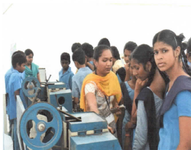
MD Alipuram Municipal High School Children visiting science projects in PSCMRCET Campus