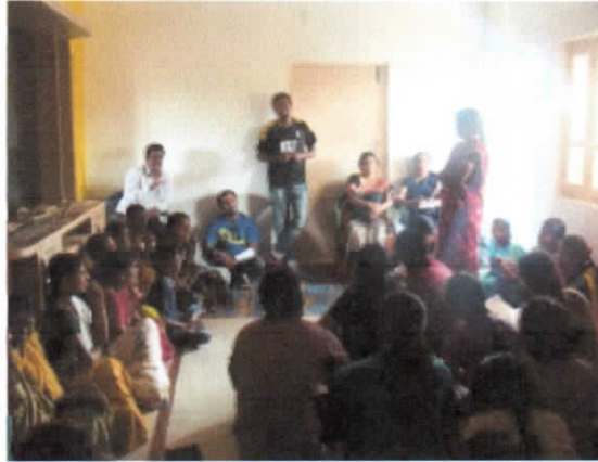
Photo: Guiding Students by NSS Volunteers