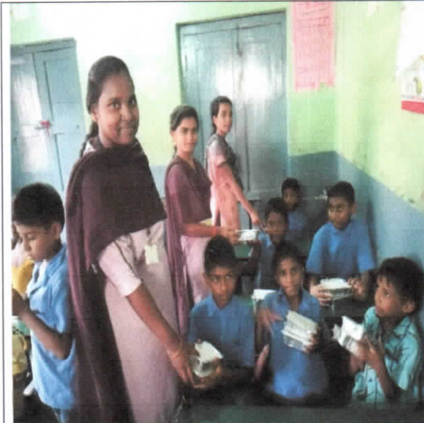
Fig:In the above figure the students of PSCMR CET has distributed Breads to school children