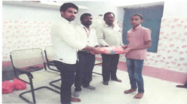
Photo: Awarding winners in various competitions at Kankipadu Village